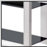
Smoked glass shelves