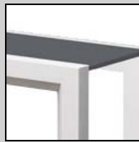
Picture frame inspired chamfered edge